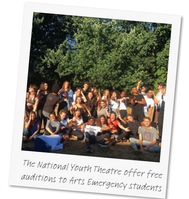
The National Youth Theatre offer free auditions to Arts Emergency students