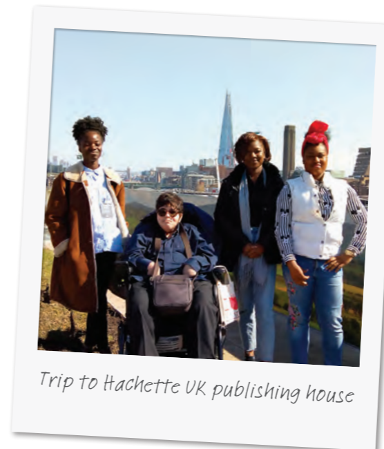
Trip to Hachette UK publishing house