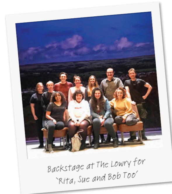
Backstage at The Lowry for 'Rita, Sue and Bob Too'