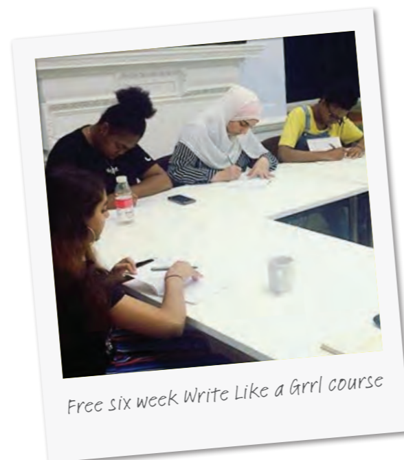
Free six week Write Like a Grrl course