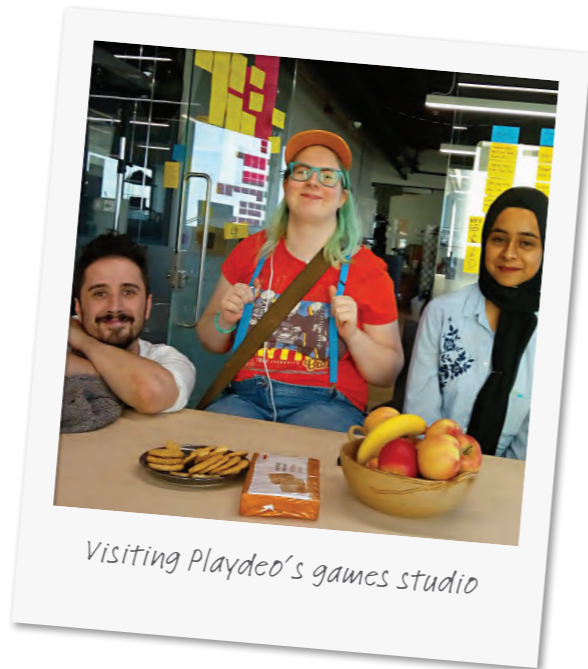
Visiting Playdeo's games studio