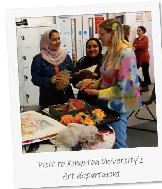
Visit to Kingston University's Art department