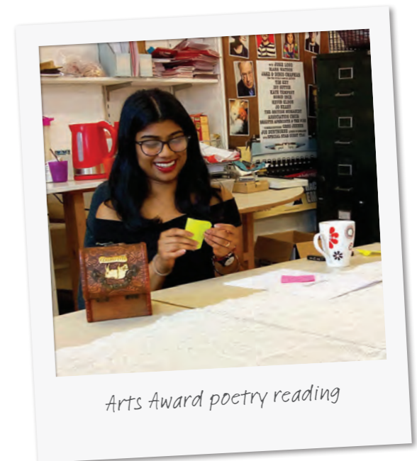
Arts Award poetry reading